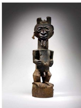
LOT 55 STATUE SONGYE A SONGYE FIGURE RÉPUBLIQUE DÉMOCRATIQUE DU CONG...

We have identified in upcoming auctions, many artifacts from the Congo, Nigeria, Benin and elsewhere which will require us to commission a thorough and detailed investigation as to how these items have come into the possession of auctioneers which are now being auctioned. Here are a few we have identified :