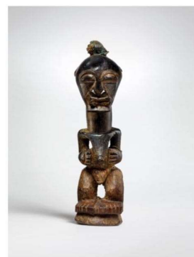
LOT 57 STATUE SONGYE A SONGYE FIGURE RÉPUBLIQUE DÉMOCRATIQUE DU CONG...

Estimate EUR 50,000 - EUR 80,000 (USD 56,937 - USD 91,099)