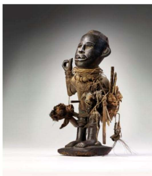
LOT 56 STATUE KONGO A KONGO FIGURE RÉPUBLIQUE DÉMOCRATIQUE DU CONG...

Estimate EUR 300,000 - EUR 500,000 (USD 341,622 - USD 569,369)